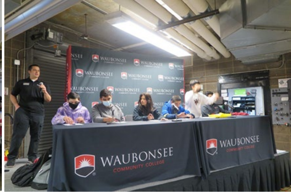
Auto/CTE Open House & Signing Day