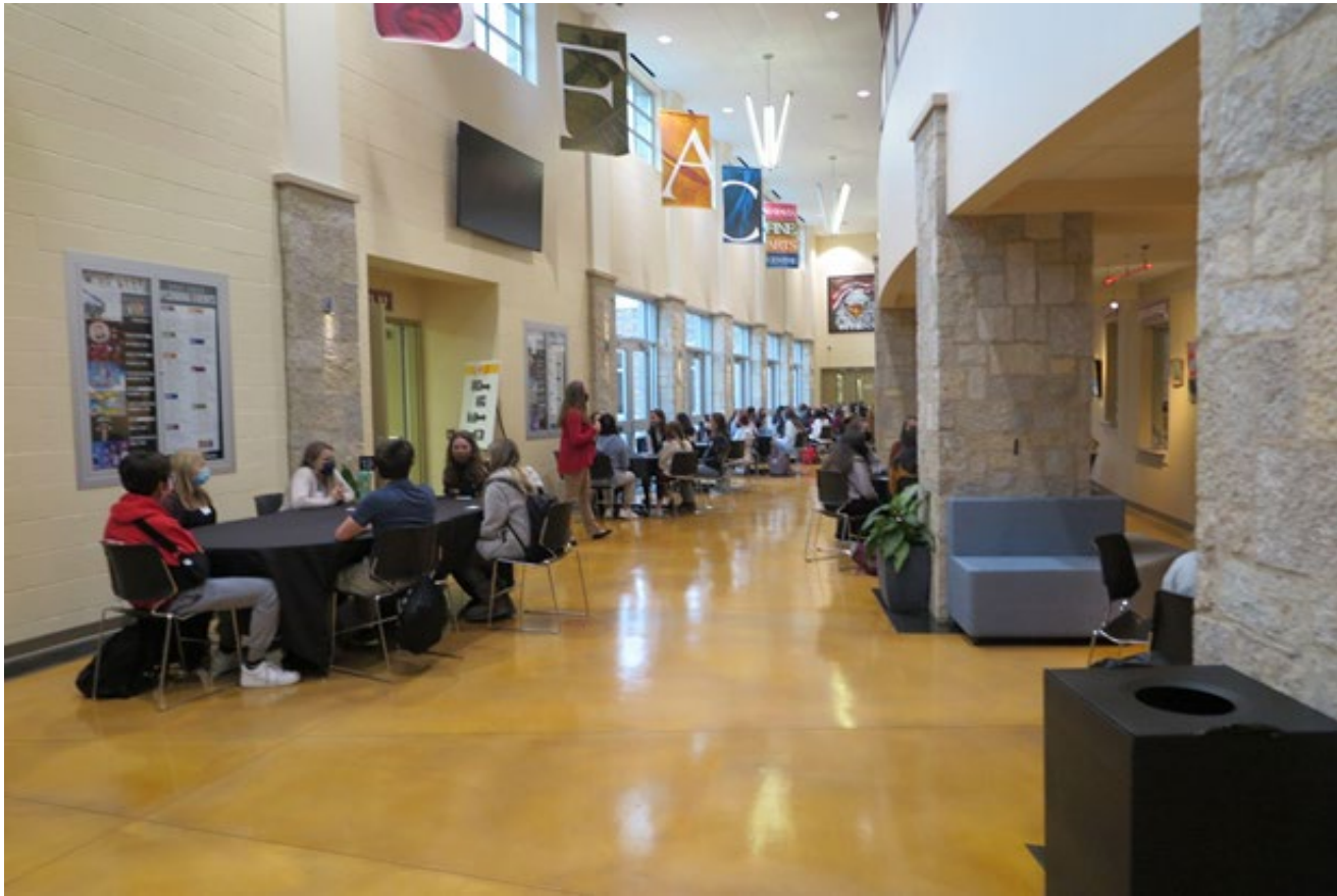
Career Connections: Education Career Exploration