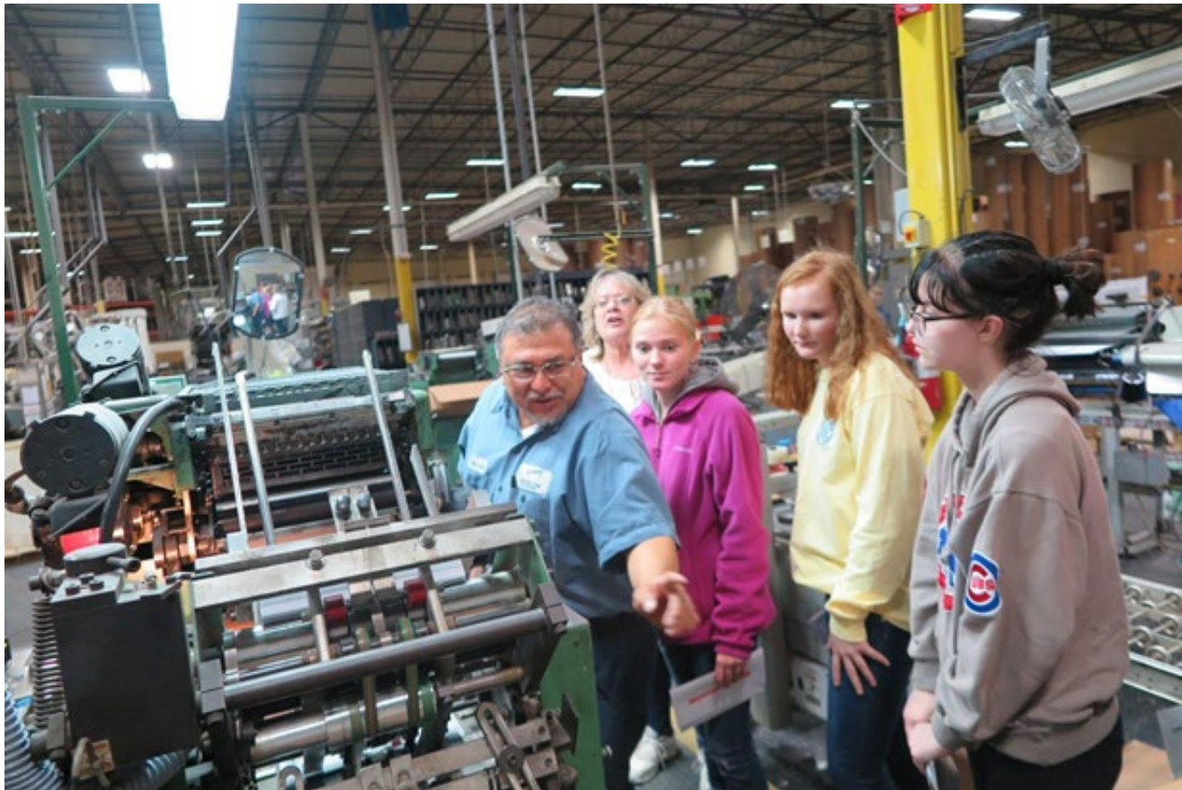
MFG Day Field Trips