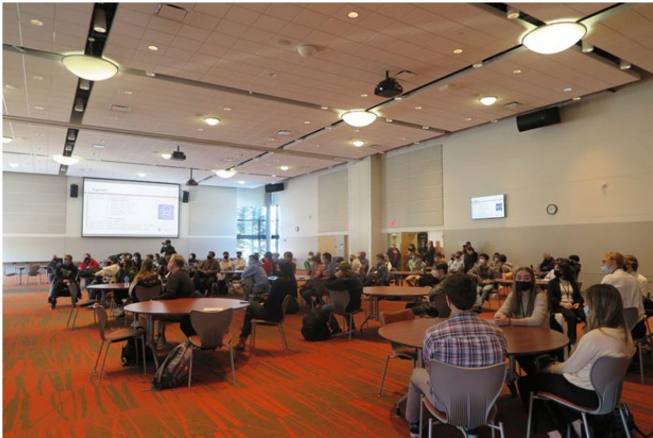
IDEA, Welding Challenge, Graphic Communications Team-Based Challenge